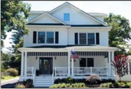
Approximately 3,200 sq. ft. — Two Story