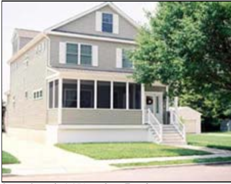
Approximately 2,350 sq. ft. — Two Story